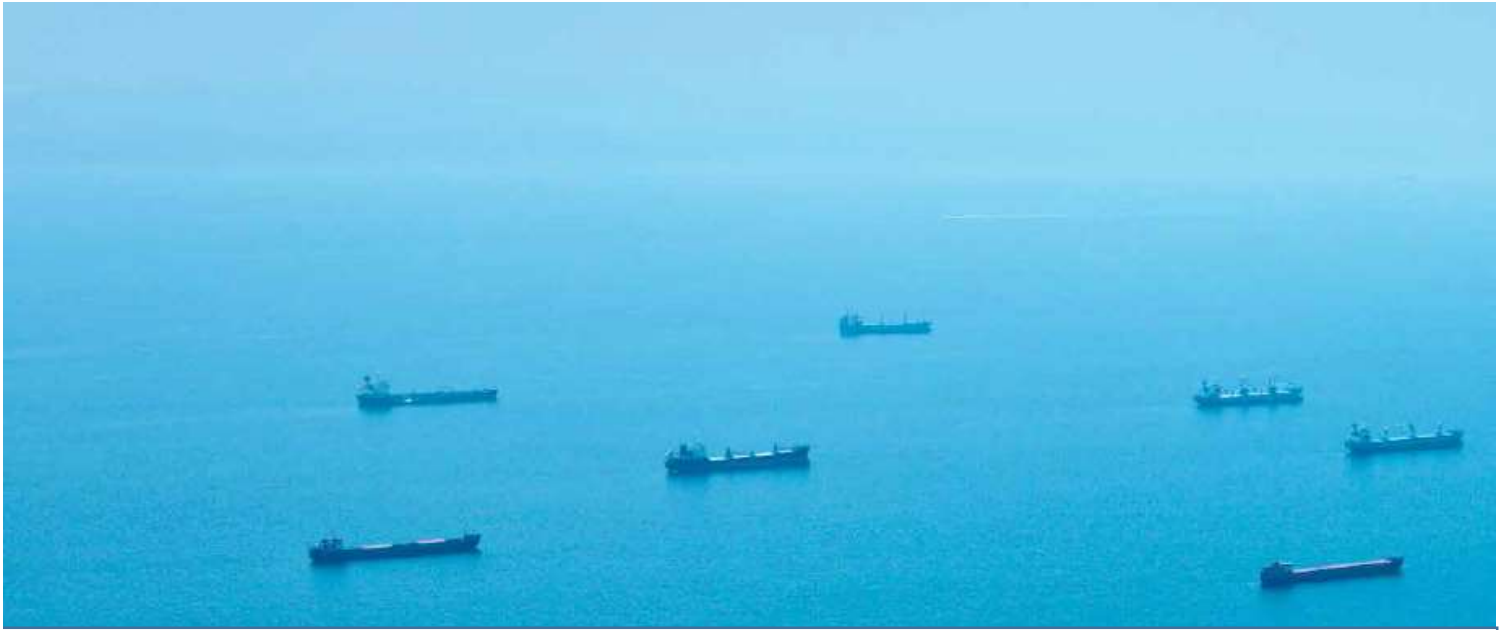
CHART TRACK NAVIGATOR SUITE

Since 1999, Chart Track has been successfully assisting Mariners to sail safely and efficiently.